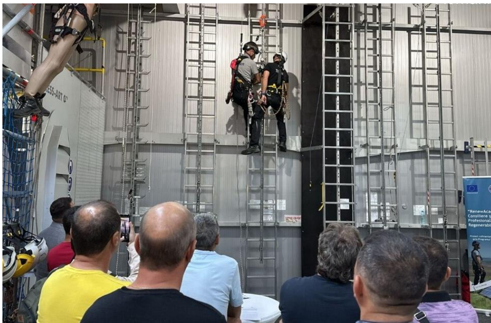
Photo: Training for working at heights with manual handling © Wind Power Energy SRL