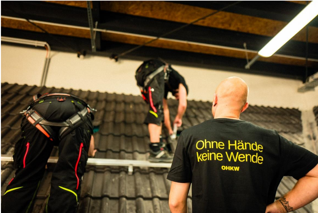
Photo: Training for working at heights with manual handling

Name of the project: Career change programmes for solar & heat pump installers