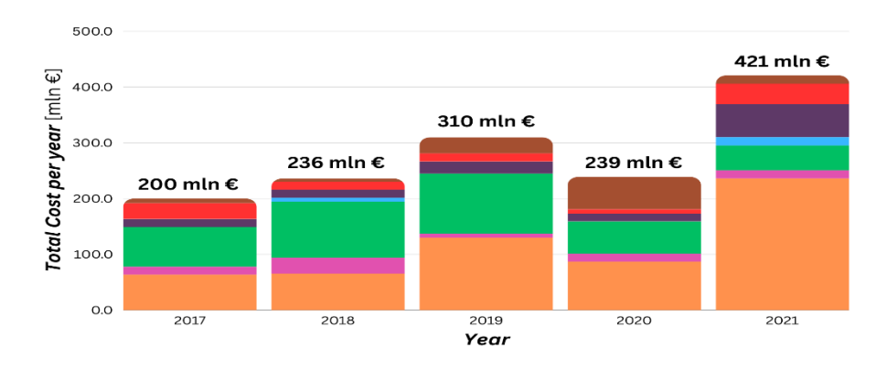
Figure 1: Public investment in energy research based on committed subsidy, in current prices.